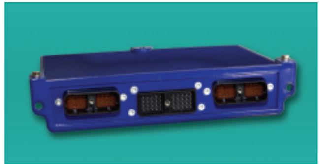
VIKING 27 SD Engine Management and Fuel Control for efi diesel engines